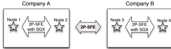
Fig. 1: Half and Half. In this usage, we convert SGX-supported 2P-SFE values to standard 2P-SFE values and back in order to take advantage of the speed of the combined form when the trust model is acceptable and still allow for a stronger model when the trust model of SGX-supported 2P-SFE is not acceptable (say, the user does not trust Intel when using a public network).