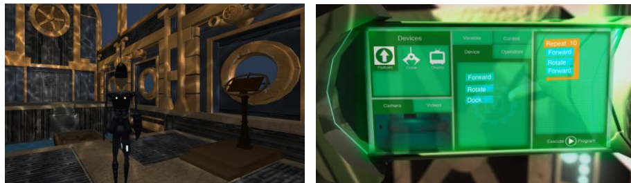
a) Game environment