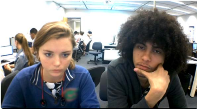
Figure 1. Students engaged in pair programming in a CS1 lab.

over his or her own version of the code. To investigate this hypothesis, we divided 200 introductory programming students into one of two different conditions. In the Traditional condition, pairs worked on the same code at one computer and were responsible for producing one common solution. In the Hybrid condition, pairs worked at side-by-side computers and each partner was responsible for producing their own code. In both conditions, students were encouraged to communicate often and to work closely together. The results showed that traditional pair programming provided comparable learning gains and significantly higher satisfaction compared to the hybrid approach.