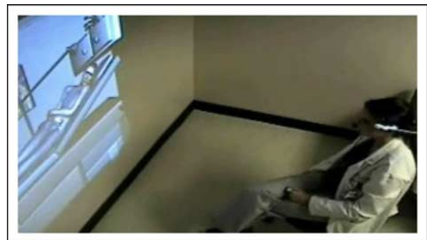
Fig. 4. Body lean—VP. The student is leaning back in the chair.

We found that medical students demonstrate nonverbal communication behaviors and respond empathetically to a VP, although the quantity and quality of these behaviors were less than those exhibited in a similar SP scenario. Clinicians rated videotapes of students interacting with SPs higher with respect to head nod and body lean. In addition, clinicians rated student SP interactions higher than VP exchanges for the level of immersion in the scenario, anxiety, attitude toward the patient, and in asking clearer questions. In a previous study, medical students responded in a post-