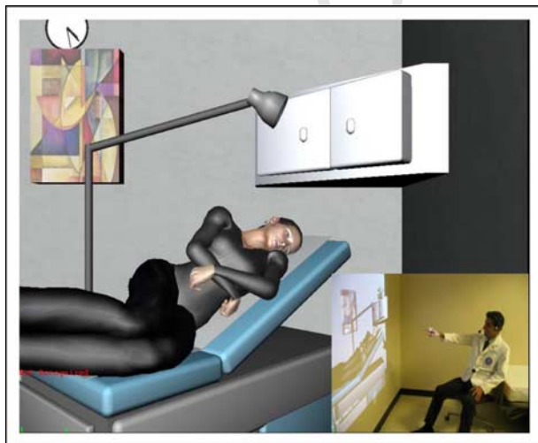
Fig. 1. The virtual scenario. A female virtual patient, DIANA, complains of abdominal pain. (Inset) Medical student interacting in the virtual scenario.

Table 2 shows a comparison of student behaviors when interacting with a VP versus an SP. Students interacting with SPs were more likely to demonstrate greater head nod