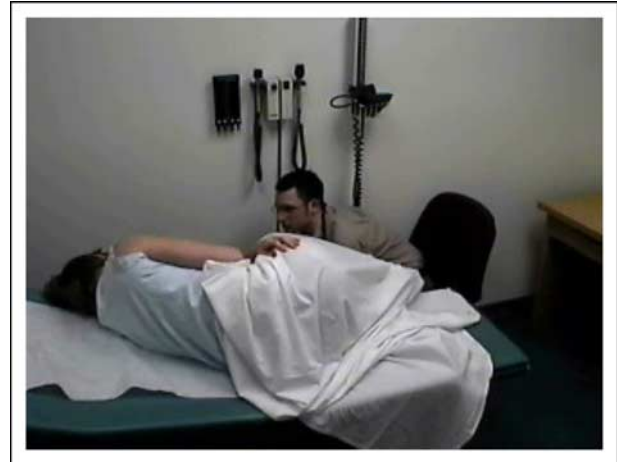
Fig. 3. Body lean—SP. The student is leaning forward and actively engaging the SP.

We have previously reported our initial interdisciplinary efforts to create, evaluate, and refine a highly immersive interaction with a VP with abdominal pain as a method to teach medical students basic history taking and communication skills. Preliminary studies reveal that most students would use the virtual teaching tool in their preparation for interaction with SPs and real patients [1–4]. In addition, a study comparing student interaction between VPs and SPs showed no difference in students asking 12-core history-taking questions and generating a similar differential diagnosis between the 2 groups [4]. However, the main purpose of the current study was to determine whether more complex communication skills, such as nonverbal behaviors and empathy, were similar when students interacted with a VP or SP.