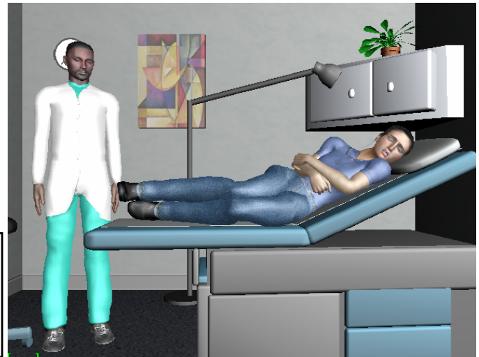
Figure 4 – VIC, the virtual instructor (left), and DIANA, the virtual patient (right), in the virtual exam room